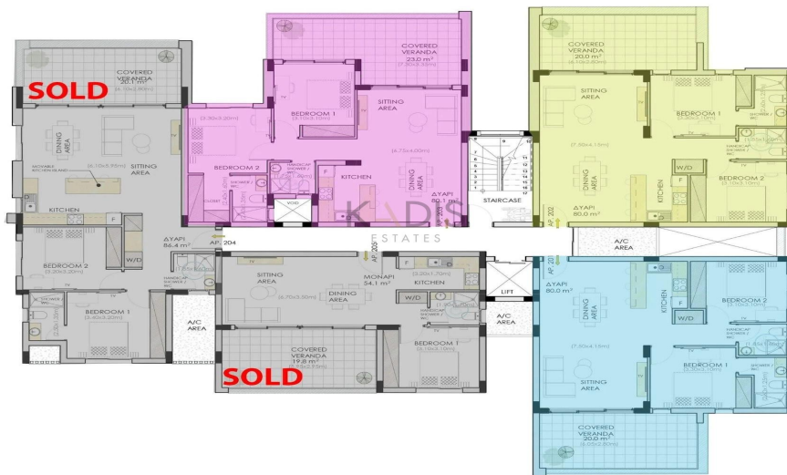
BLOCK B - SECOND FLOOR PLAN 1 : 100