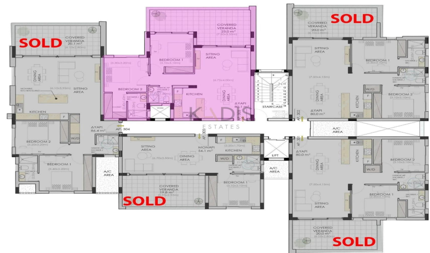
BLOCK B - THIRD FLOOR PLAN 1 : 100