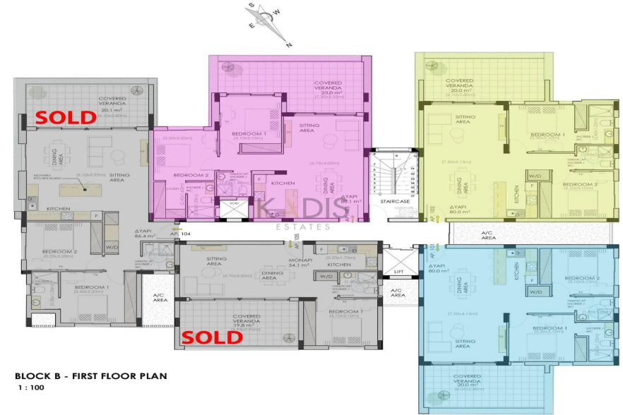
BLOCK B - FIRST FLOOR PLAN 1 : 100