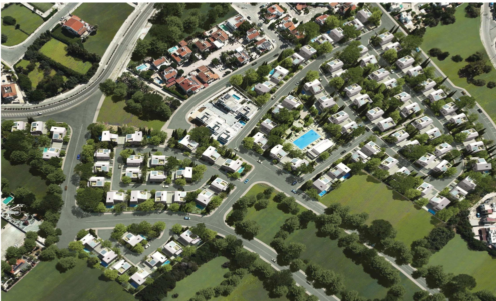
Villa Three-Bedroom H1