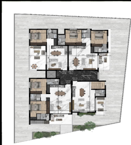
2 ND AND 3 RD FLOOR