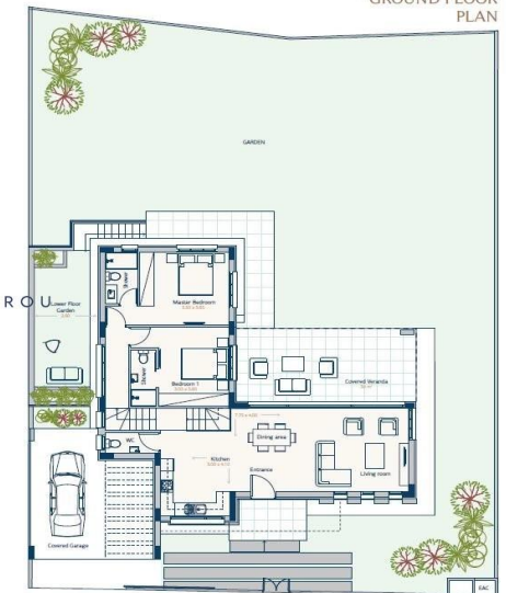
TYPE A GROUND FLOOR PLAN