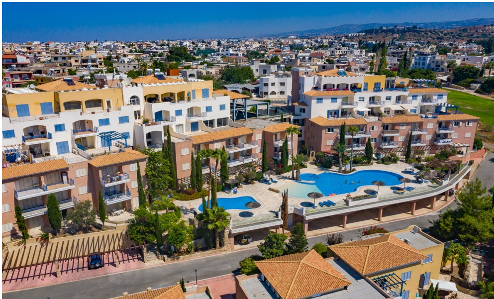
APHRODITE SPRINGS | LOCATION