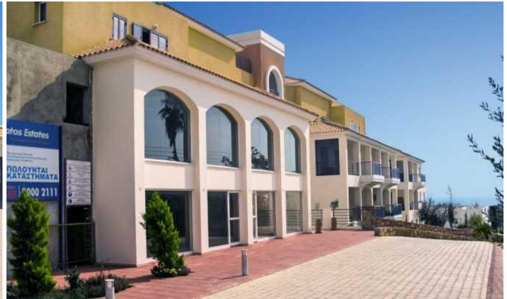
APHRODITE SPRINGS | LOCATION