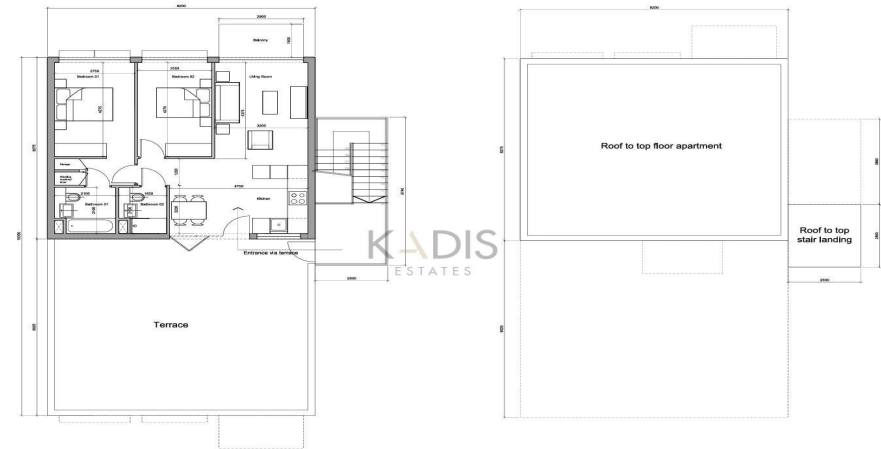
01 2 Bed Cluster - Level 02 Plan