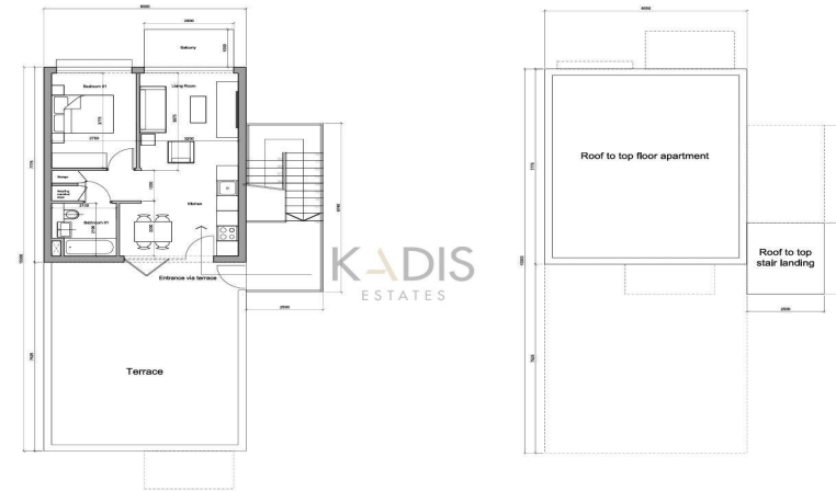
01 1 Bed Cluster - Level 02 Plan