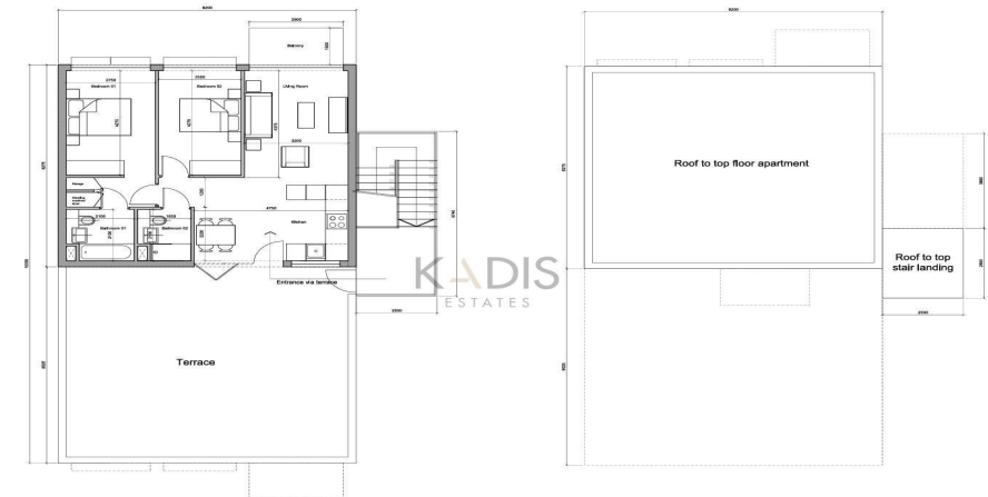
01 2 Bed Cluster - Level 02 Plan