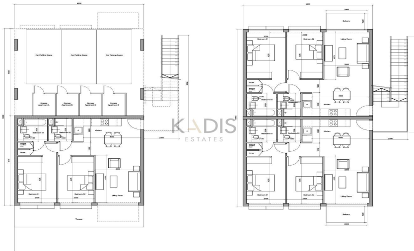
01 2 Bed Cluster - Ground Floor Plan