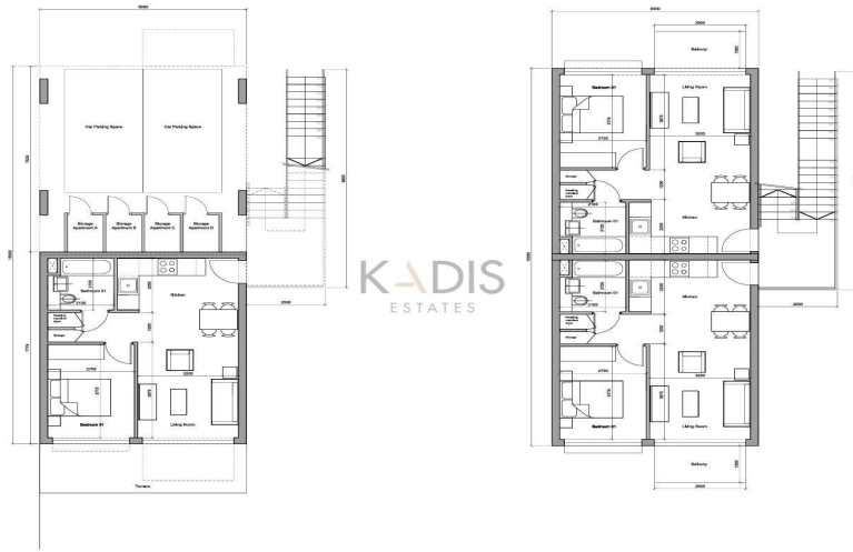
01 1 Bed Cluster - Ground Floor Plan