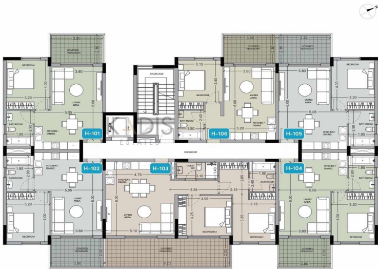
block H 2nd floor