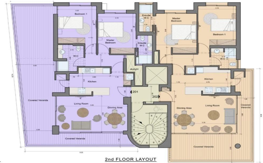
2nd FLOOR LAYOUT