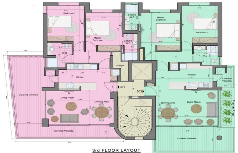
3rd FLOOR LAYOUT