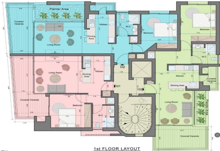
1st FLOOR LAYOUT