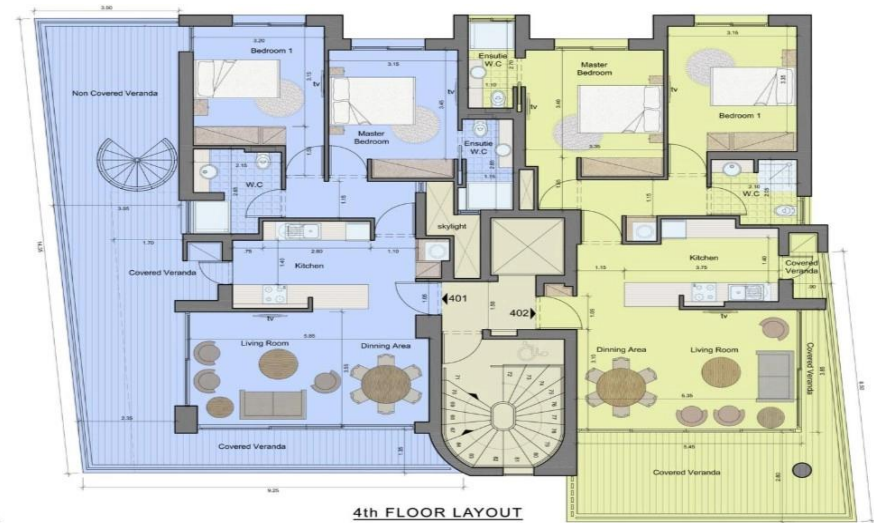
4th FLOOR LAYOUT