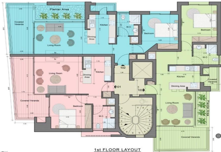
1st FLOOR LAYOUT