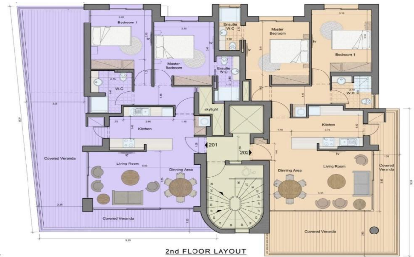
2nd FLOOR LAYOUT