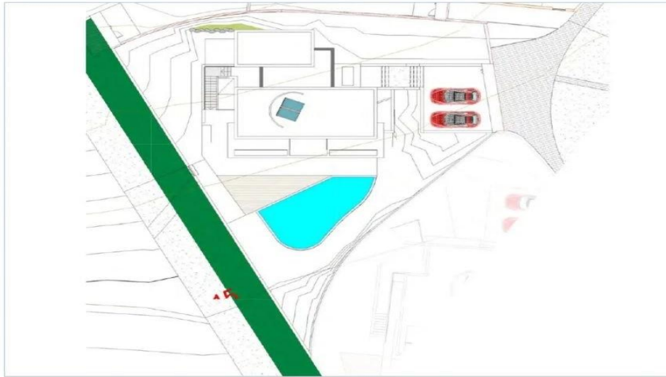
PRELIMINARY SITE PLAN