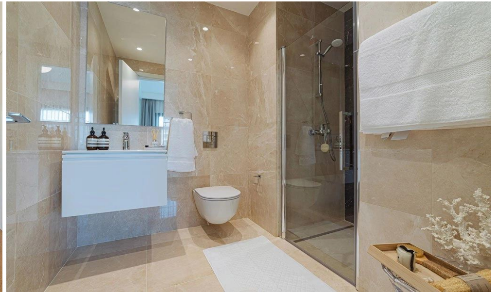
• block a