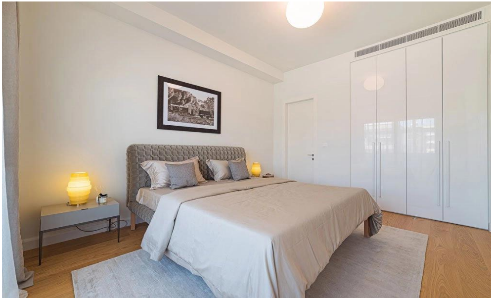
block B apartment 305