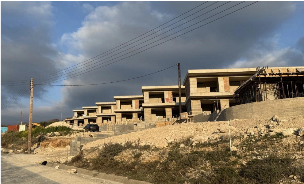
TYPE A | 3 Bedroom | Villa 2,3,4,5,6,7 & 8