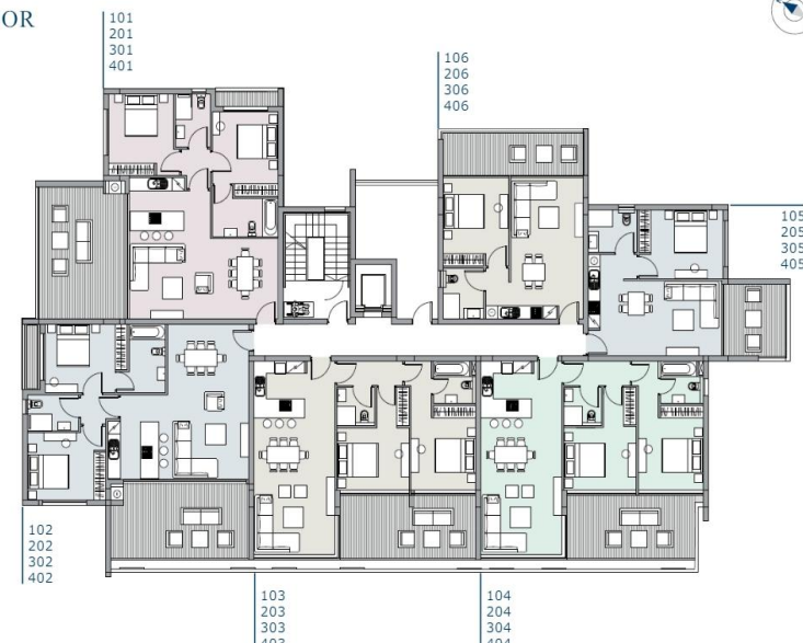
1 ST , 2 ND , 3 RD & 4 TH FLOOR