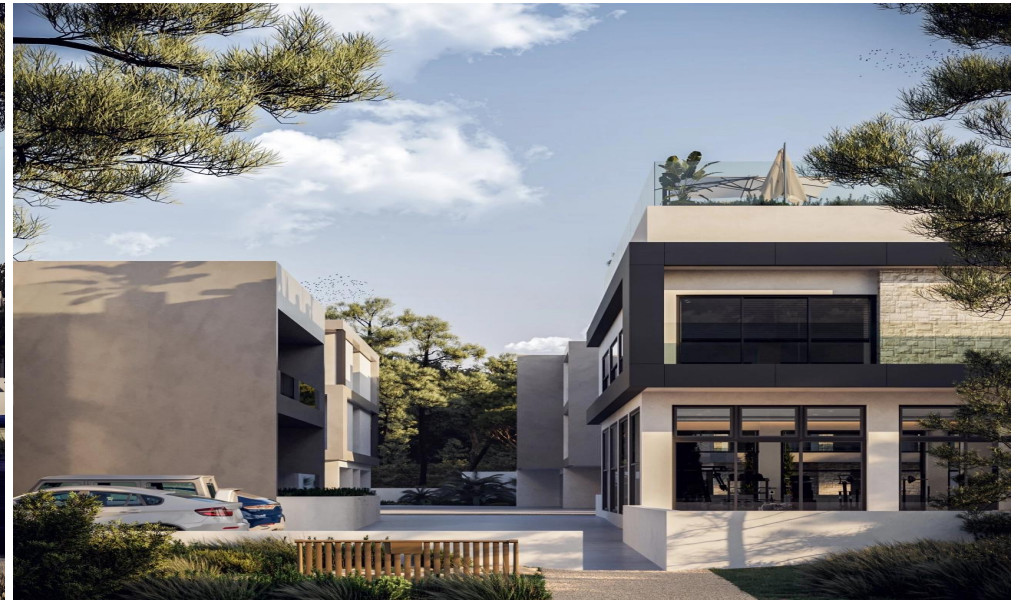
Projects Plan | Apt 1,2,3,4,5,101,102,103,104,105 | Block L