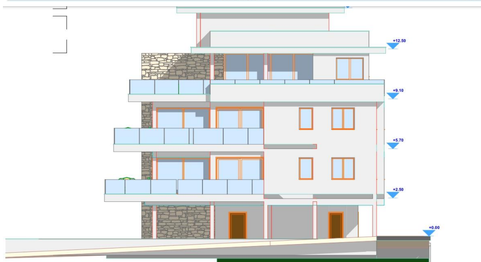
ΝΟΤΙΑ ΟΨΗ 1:100