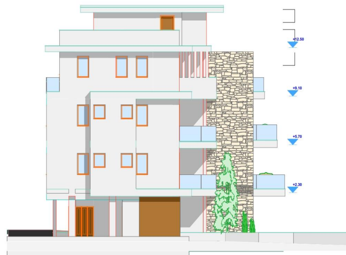
ΒΟΡΕΙΑ ΟΨΗ 1:100