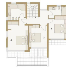
First floor - A4