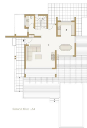
Ground floor - A4