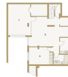
Lower ground floor - A4