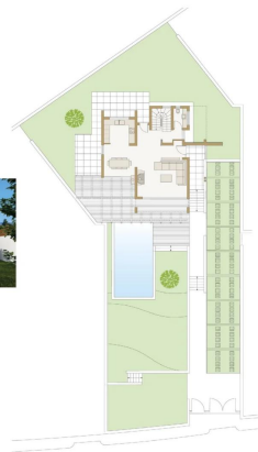
Landscape view - A4

*Suggested use All areas are for indication only