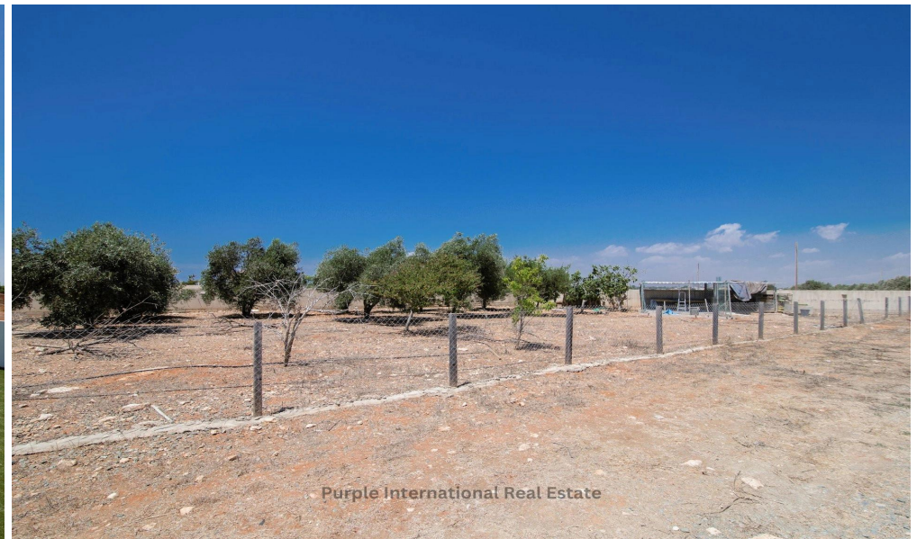
Purple International Real Estate