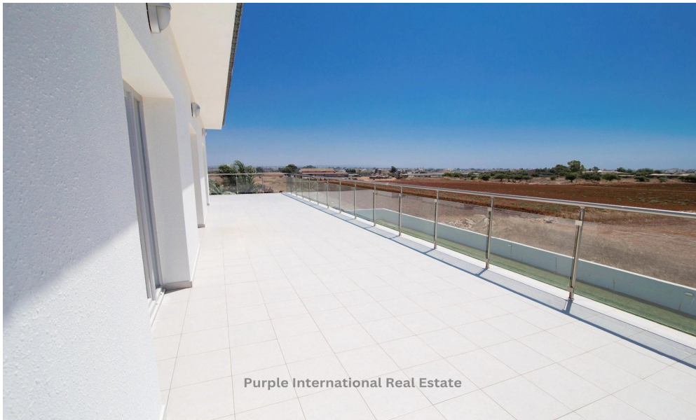
Purple International Real Estate