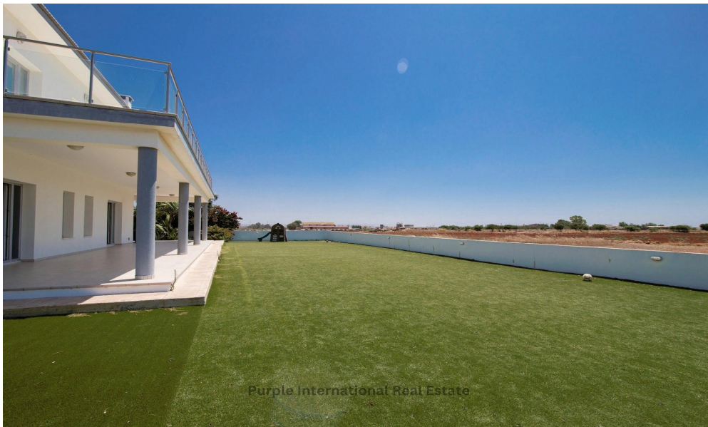
Purple International Real Estate