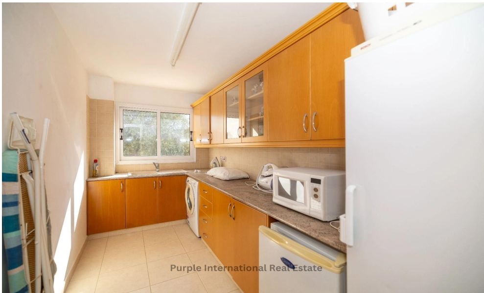
Purple International Real Estate