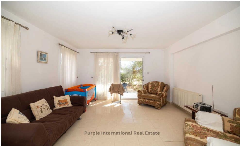
Purple International Real Estate