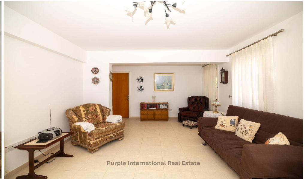
Purple International Real Estate