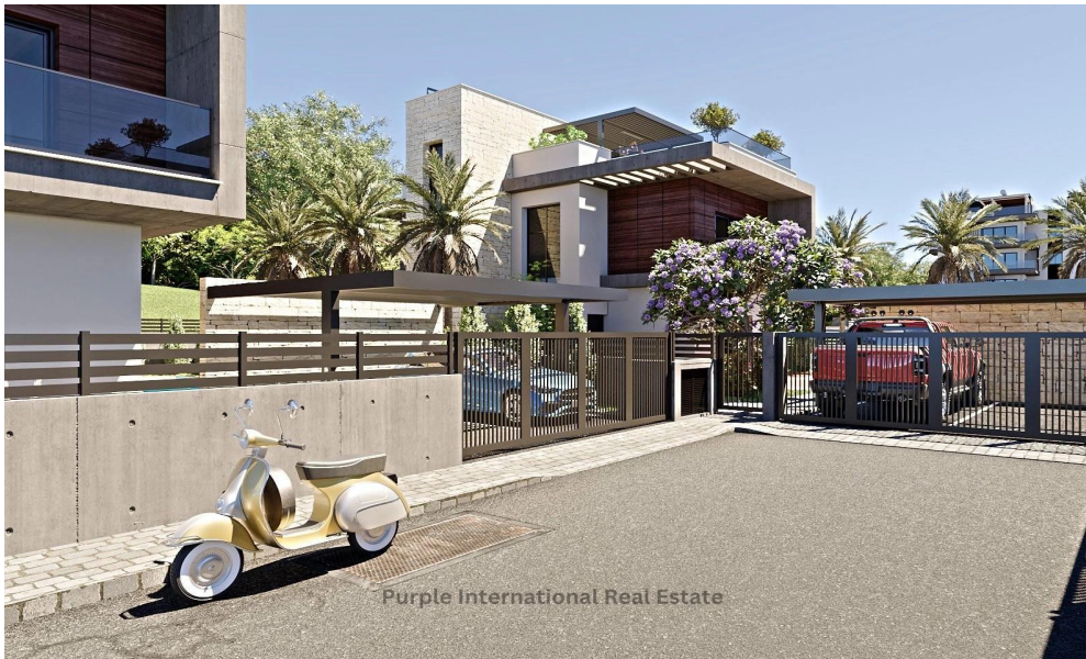
Villa C Total - 349,80 m2 Plot area - 530,00 m2 First floor