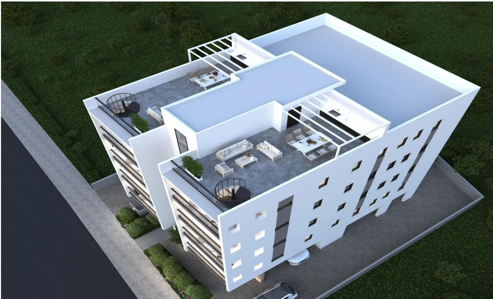
ROOF GARDEN >>