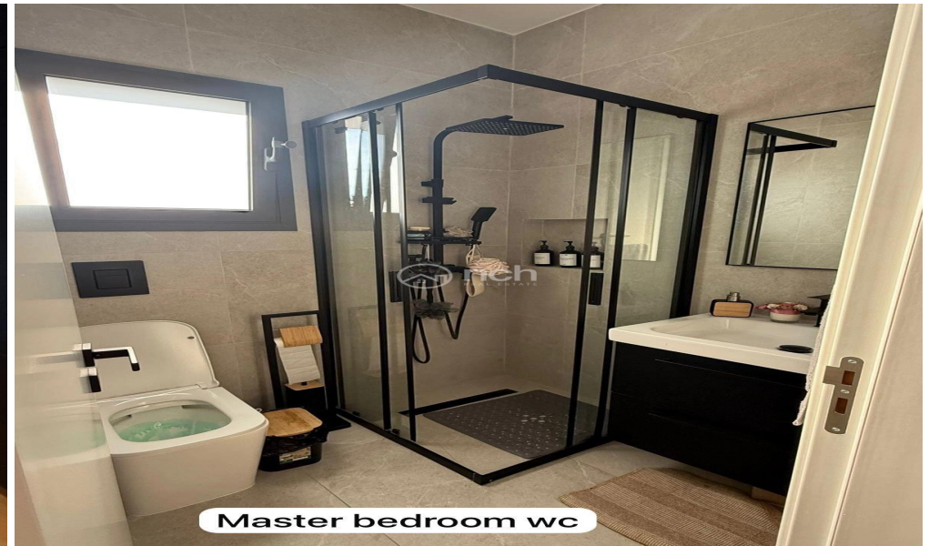
Master bedroom wc