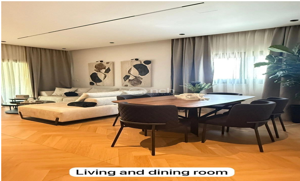
Living and dining room