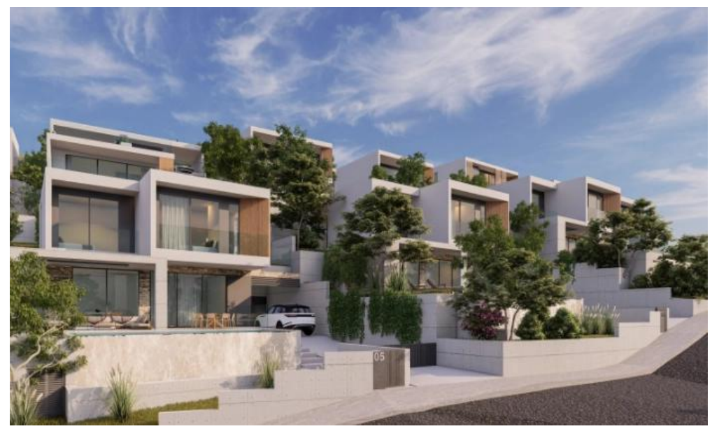
Villa 1-Architectural Plans