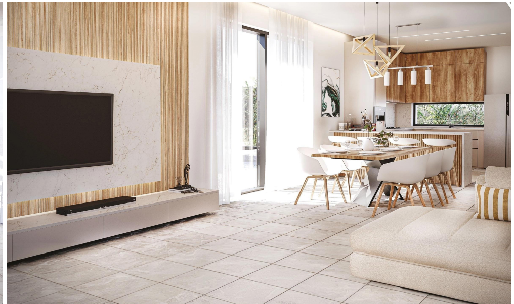
VILLA 3 | 3 Bedroom