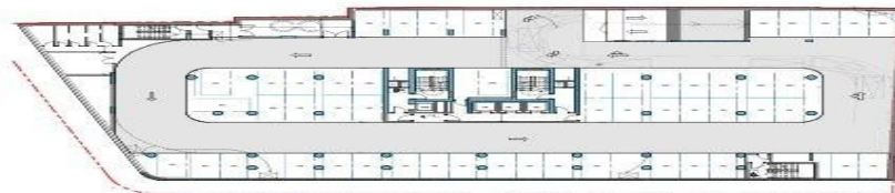
parking level -1