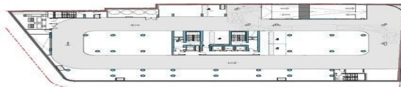
parking level -1