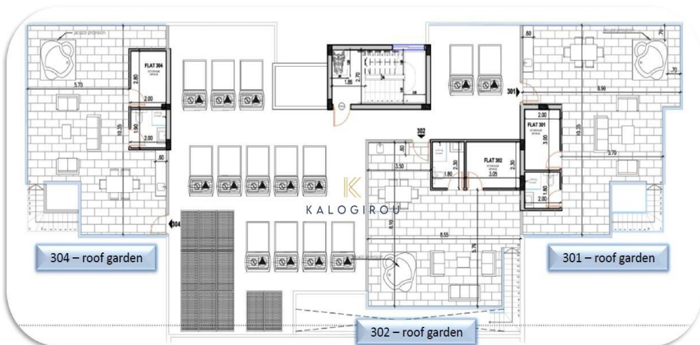
ROOF FLOOR PLANS — ROOF GARDENS