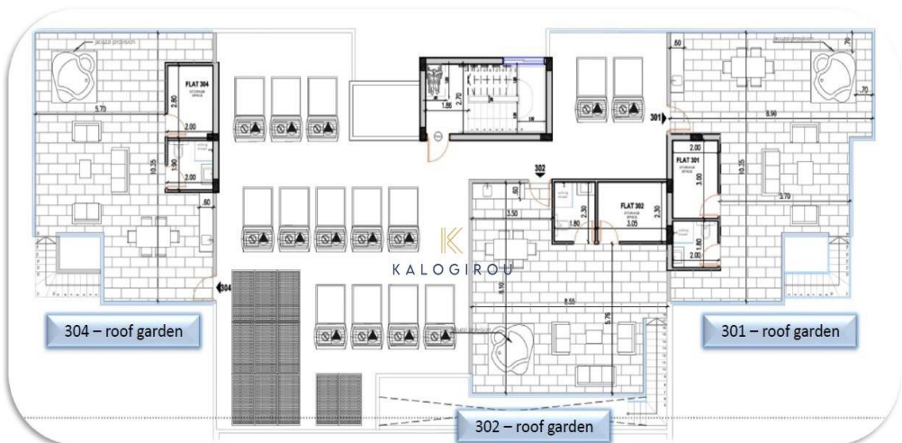
ROOF FLOOR PLANS — ROOF GARDENS