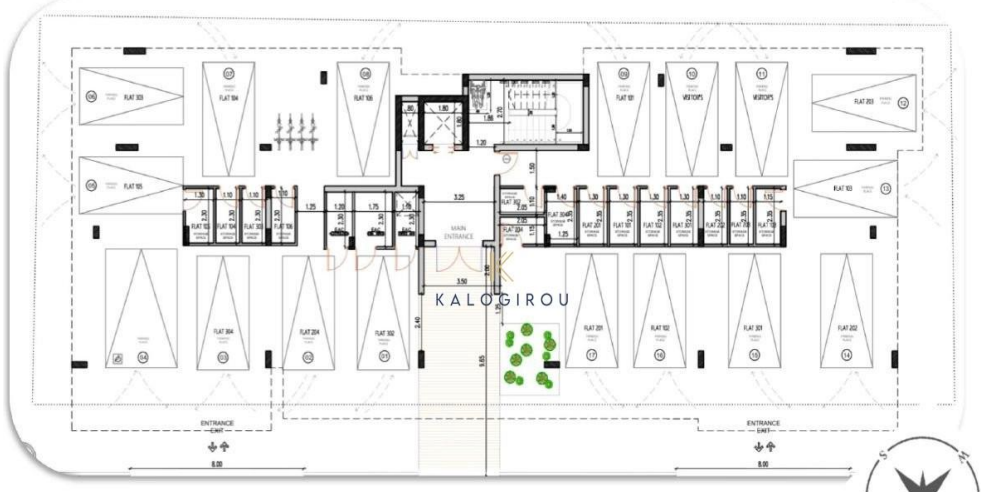
GROUND FLOOR PARKING & STORAGE