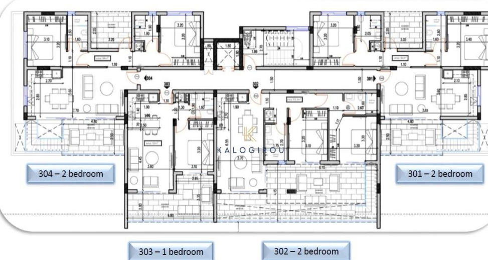
3 RD FLOOR PLANS — 1 & 2 BEDROOM APARTMENTS