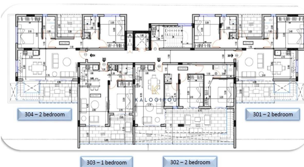
3 RD FLOOR PLANS — 1 & 2 BEDROOM APARTMENTS