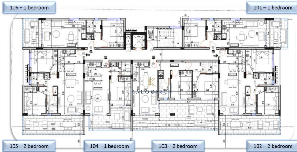
1 ST FLOOR PLANS — 1 & 2 BEDROOM APARTMENTS