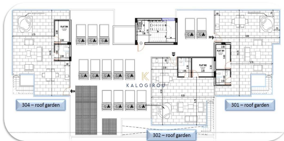
ROOF FLOOR PLANS — ROOF GARDENS