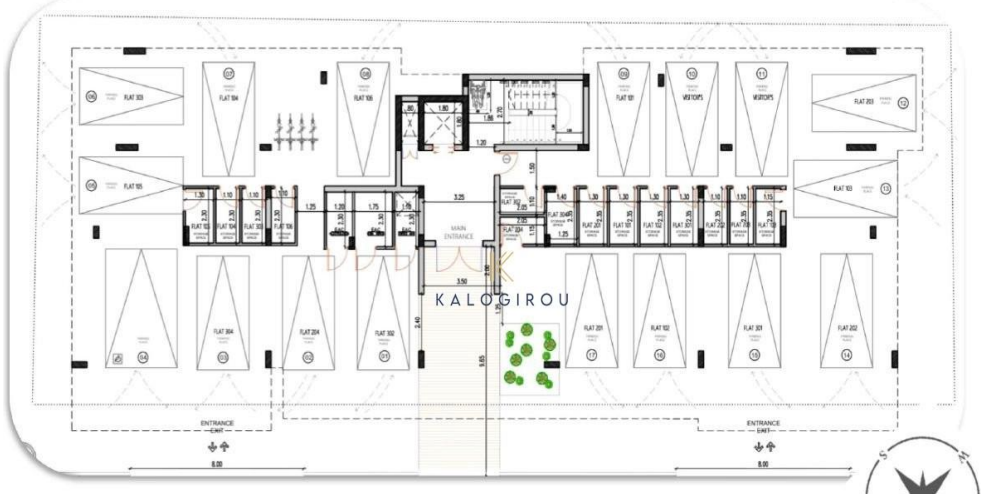
GROUND FLOOR PARKING & STORAGE