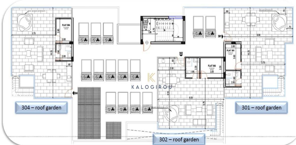
ROOF FLOOR PLANS — ROOF GARDENS