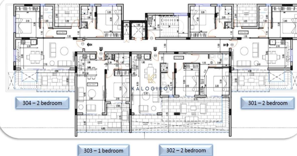
3 RD FLOOR PLANS — 1 & 2 BEDROOM APARTMENTS