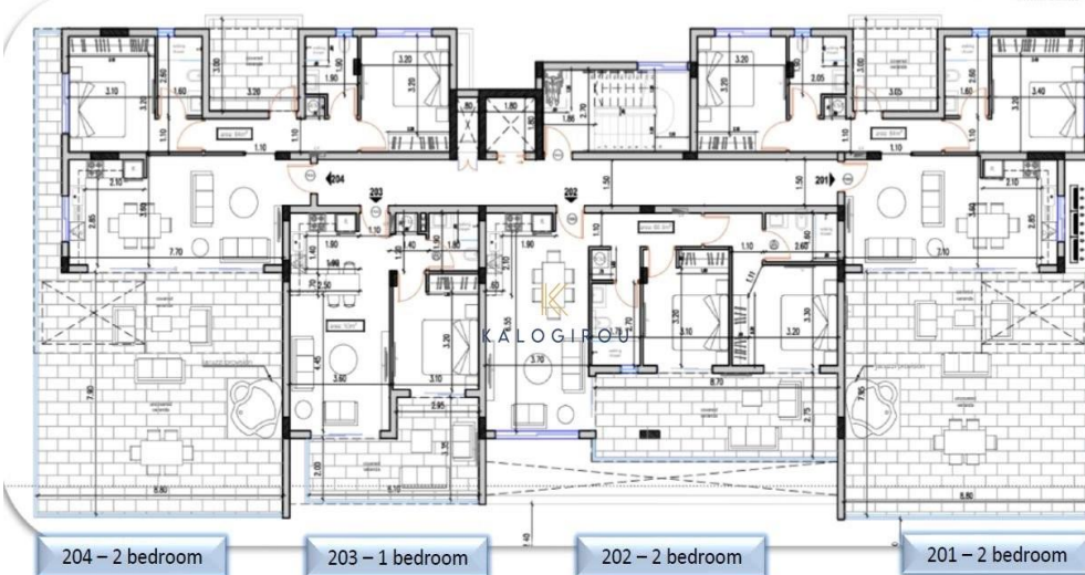
2 ND FLOOR PLANS — 1 & 2 BEDROOM APARTMENTS