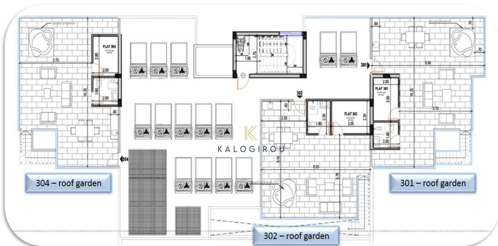
ROOF FLOOR PLANS — ROOF GARDENS