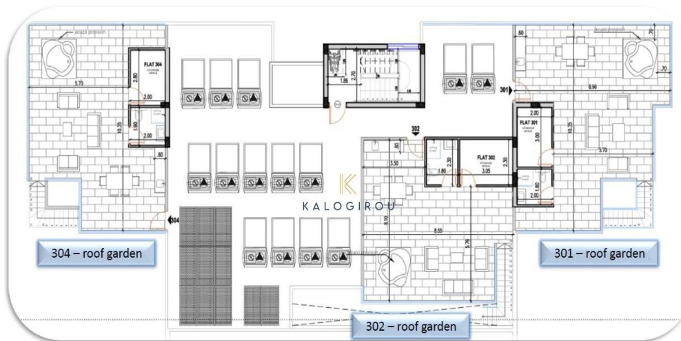
ROOF FLOOR PLANS – ROOF GARDENS