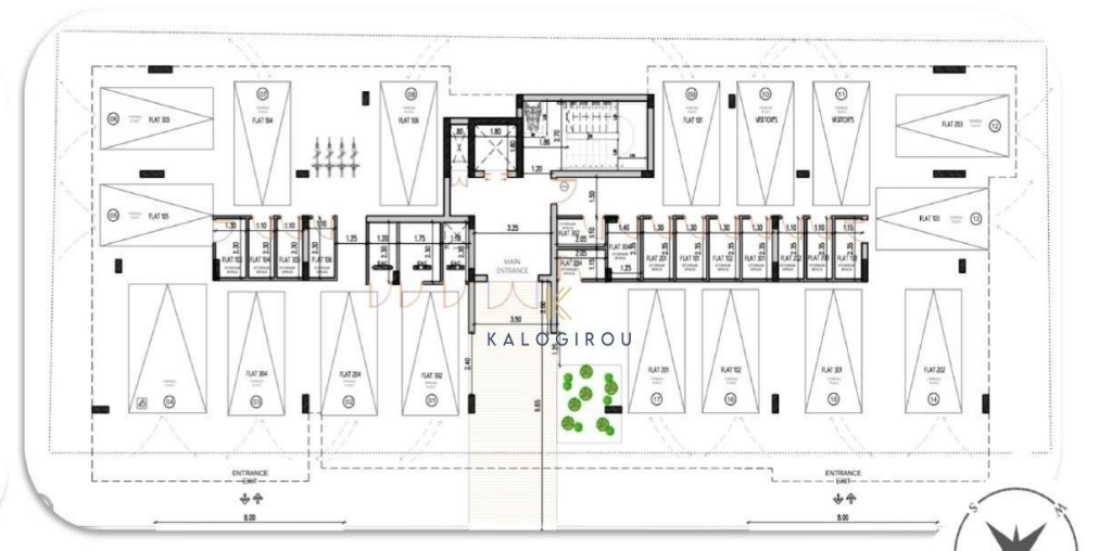
GROUND FLOOR PARKING & STORAGE