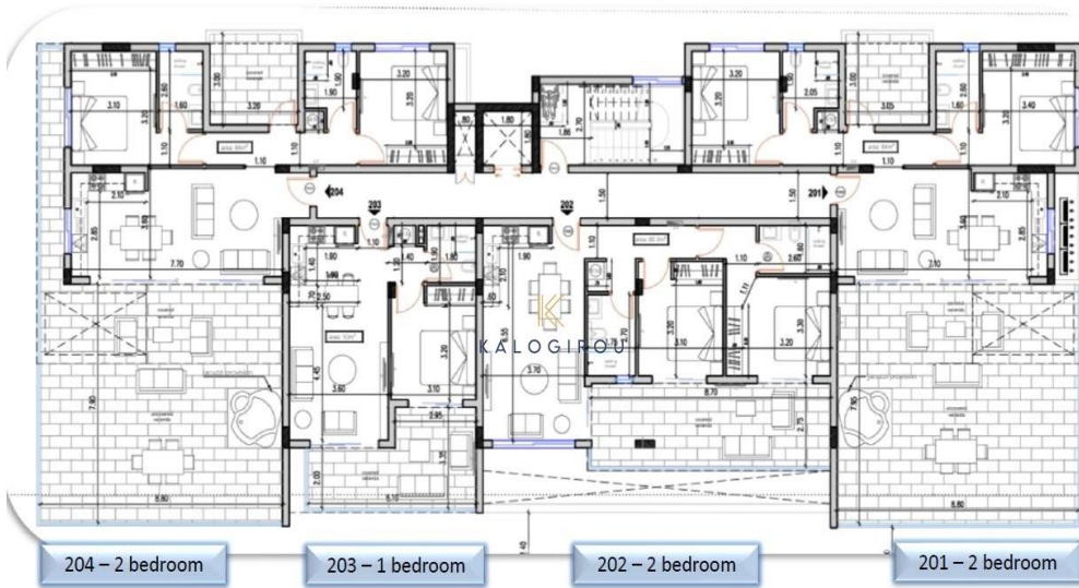
2 ND FLOOR PLANS – 1 & 2 BEDROOM APARTMENTS