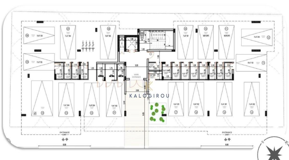
GROUND FLOOR PARKING & STORAGE