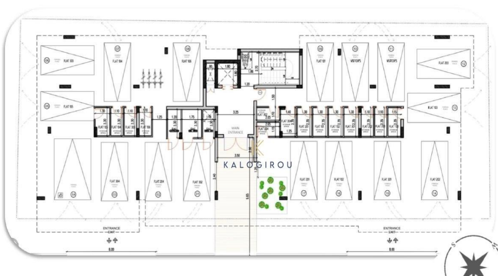
GROUND FLOOR PARKING & STORAGE