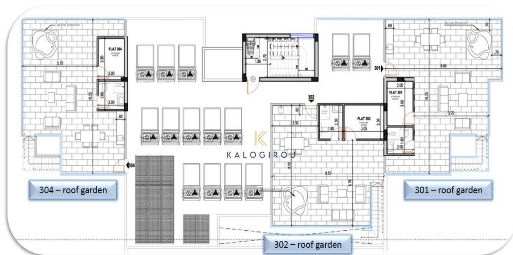
ROOF FLOOR PLANS — ROOF GARDENS