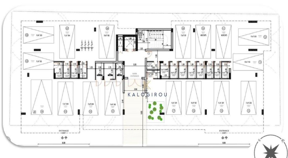
2 ND FLOOR PLANS – 1 & 2 BEDROOM APARTMENTS