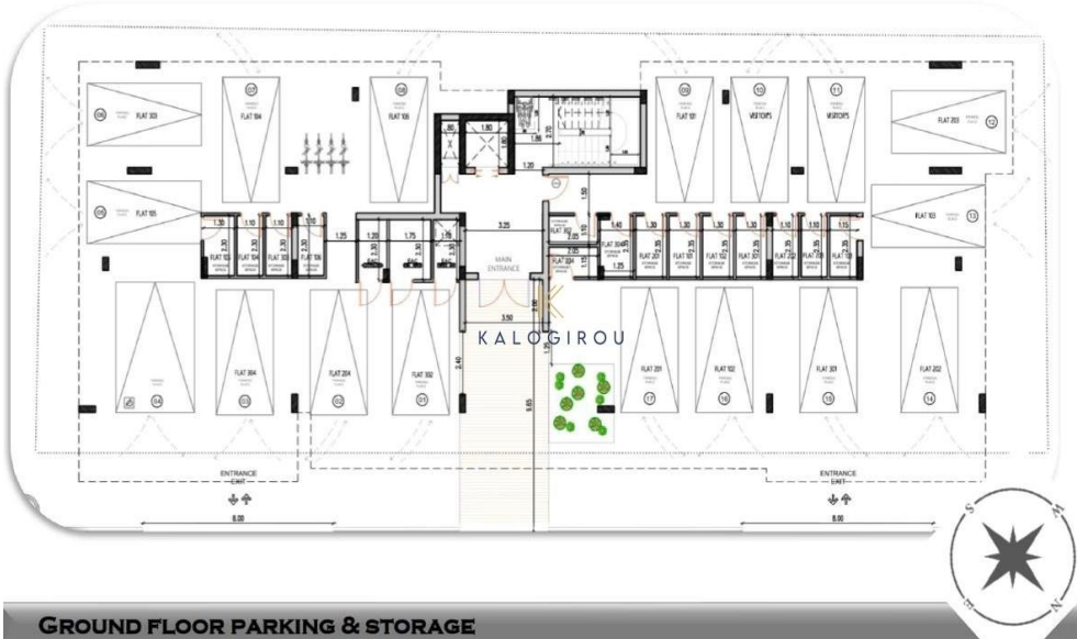
GROUND FLOOR PARKING & STORAGE