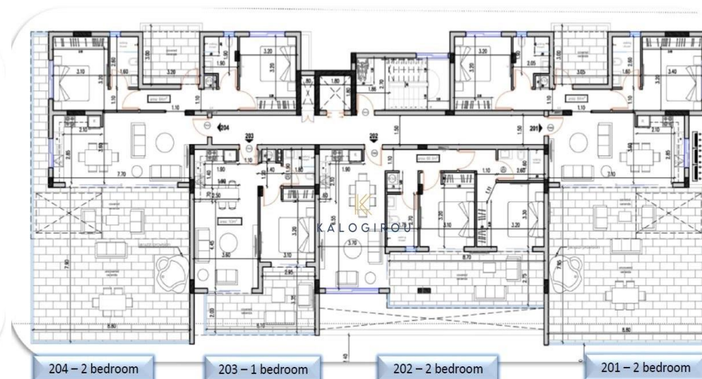
2 ND FLOOR PLANS – 1 & 2 BEDROOM APARTMENTS