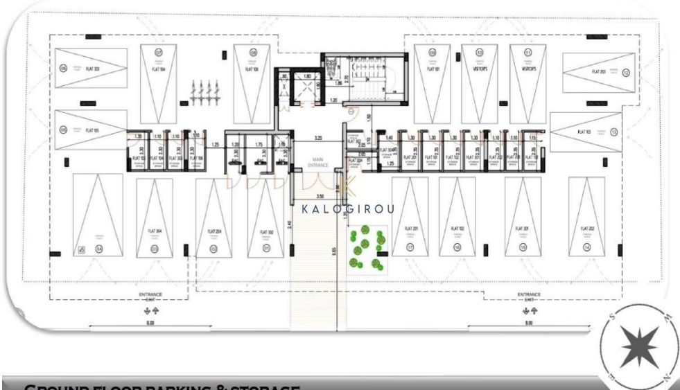
GROUND FLOOR PARKING & STORAGE