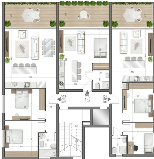
STUDIO 35.7 SQM + 13.5 SQM COVERED