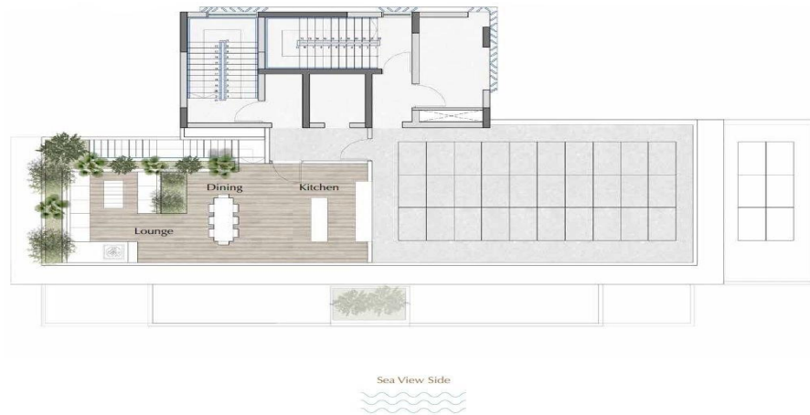
Penthouse Roof Top Garden