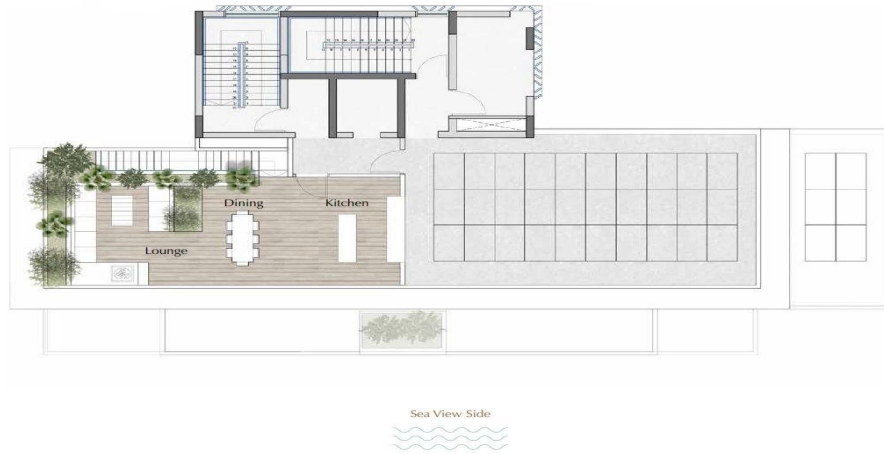
Penthouse Roof Top Garden