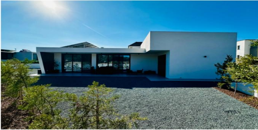
HOUSE TYPE C