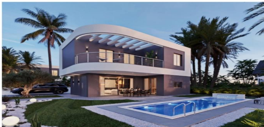
HOUSE TYPE B