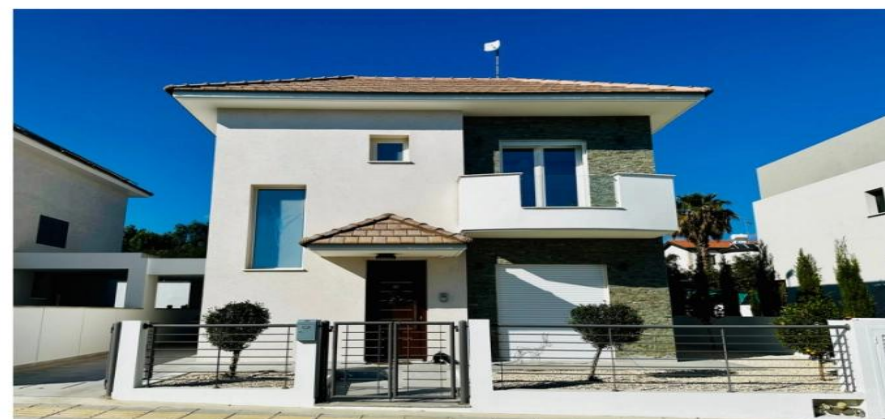
HOUSE TYPE A