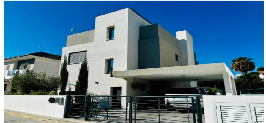
HOUSE TYPE D