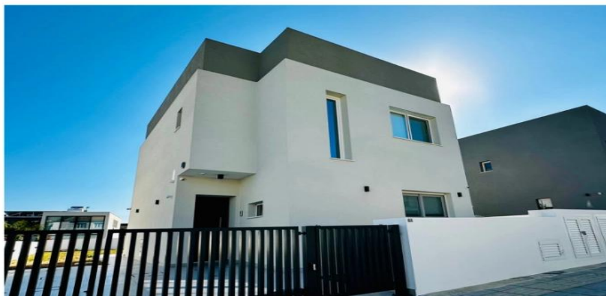
HOUSE TYPE E