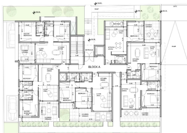
Block A // Ground floor