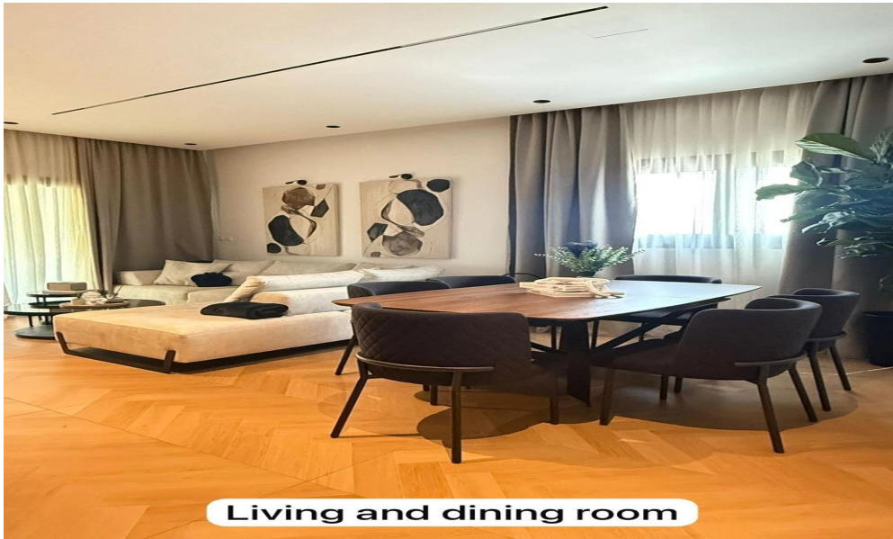
Living and dining room