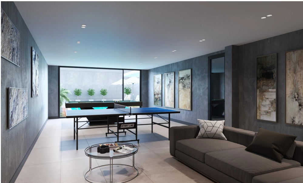
1st Floor ground floor