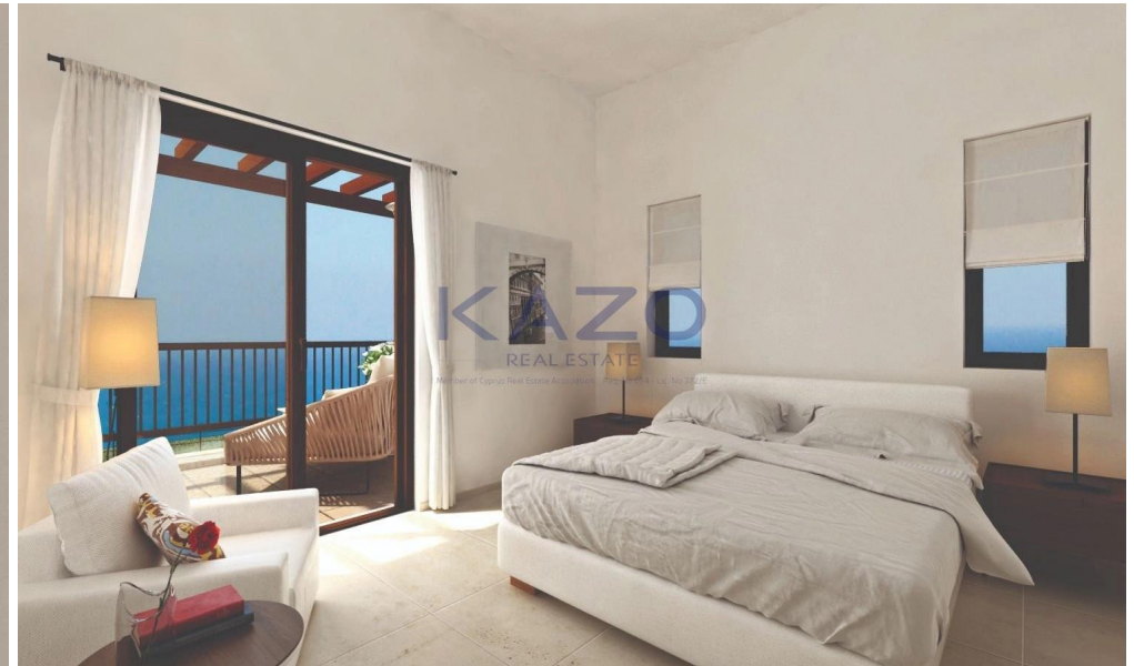
2 BEDROOM VILLA