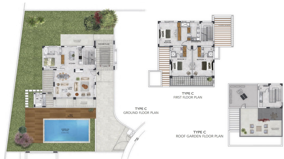
VILLA TYPE C FOUR BEDROOM | VILLA 10, 23, 24, 25, 26, 27, 28, 29 AND 30