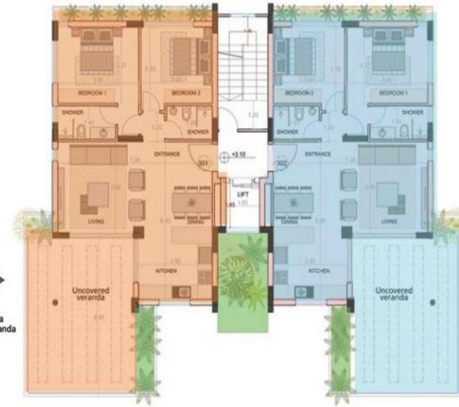
302 2 Bedrooms 2 Bathrooms 83 SQM Internal Area 40 SQM Uncovered Veranda