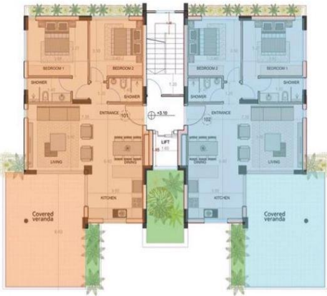
102 2 Bedrooms 2 Bathrooms 83 SQM Internal Area 40 SQM Covered Veranda