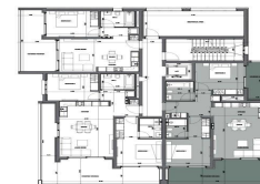
2nd floor plan