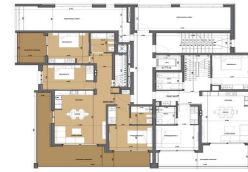
5th floor plan