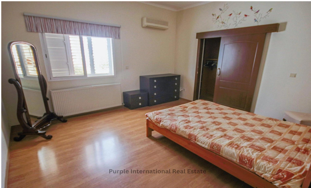
Purple International Real Estate