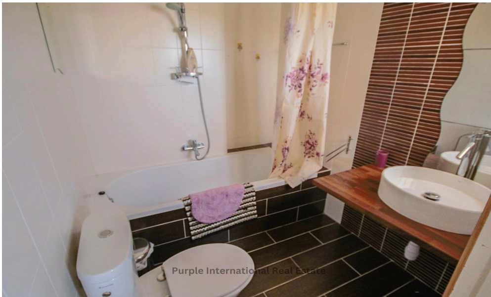
Purple International Real Estate