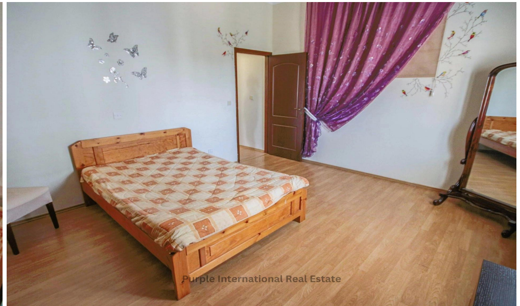
Purple International Real Estate