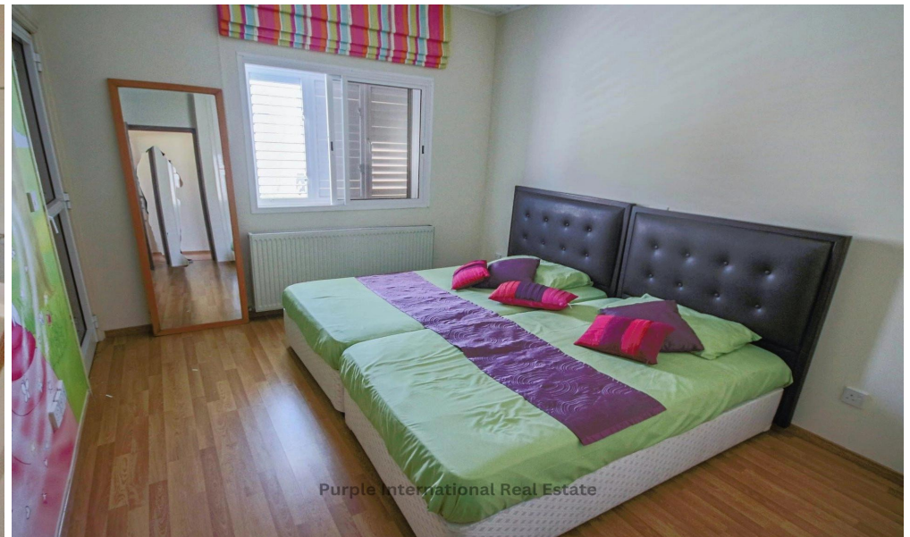
Purple International Real Estate