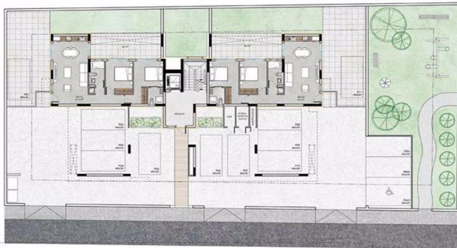
BLOCK C - GROUND FLOOR